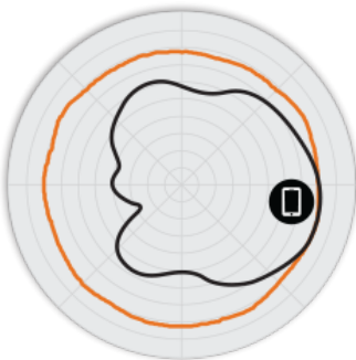
Figure 2. H320 2.4GHz Azimuth Antenna Patterns