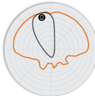
Figure 4. H320 2.4GHz Elevation Antenna Patterns