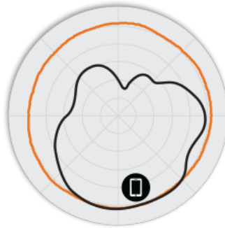
Figure 3. H320 5GHz Azimuth Antenna Patterns